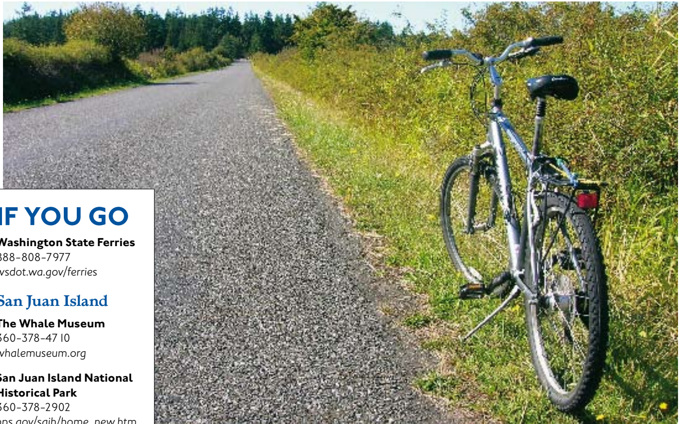
Exploring Lopez (top) Biking along one of Lopez' roads; (below) view from the shore of Lopez Island