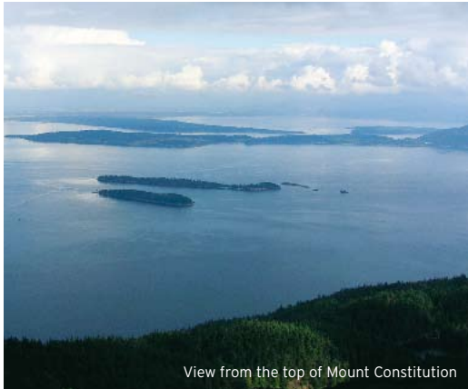
View from the top of Mount Constitution

A leisurely drive—make sure to fill up in Friday Harbor, it's the only place you'll find fuel—through the island's rolling countryside on the way to a park for hiking, or to the San Juan Vineyards, is definitely in order.