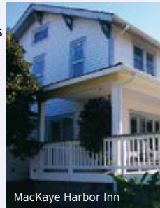
MacKaye Harbor Inn

Accommodations on the San Juan Islands are as varied as the landscape; from charming bed-and-breakfasts nestled in the woods to waterfront resorts, there is something for everyone.