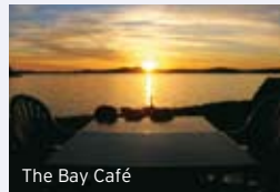
The Bay Café

Locally produced ingredients and fresh seafood characterize much of the islands' cuisine. From hearty diner breakfasts to sophisticated, romantic dinners to waterfront ale houses, you'll need an appetite for more than just adventure when you come to the San Juans.