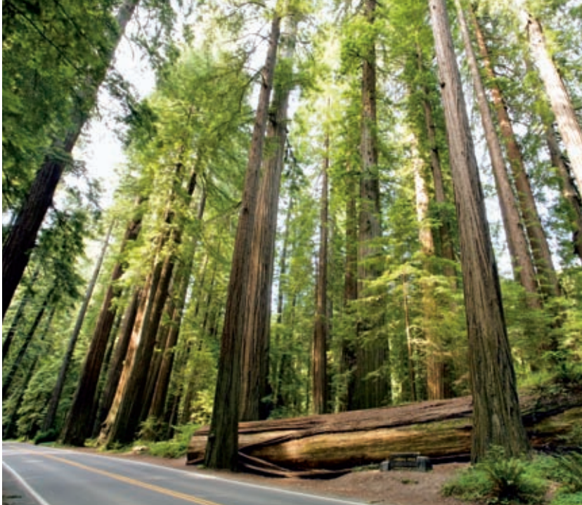
TREES COMPANY The Avenue of the Giants, a 31-mile stretch of road in California's Humboldt Redwoods State Park, is lined with trees that can grow as tall as 370 feet

After cruising along the 101 for a while, we turn off to pick up the aptly named