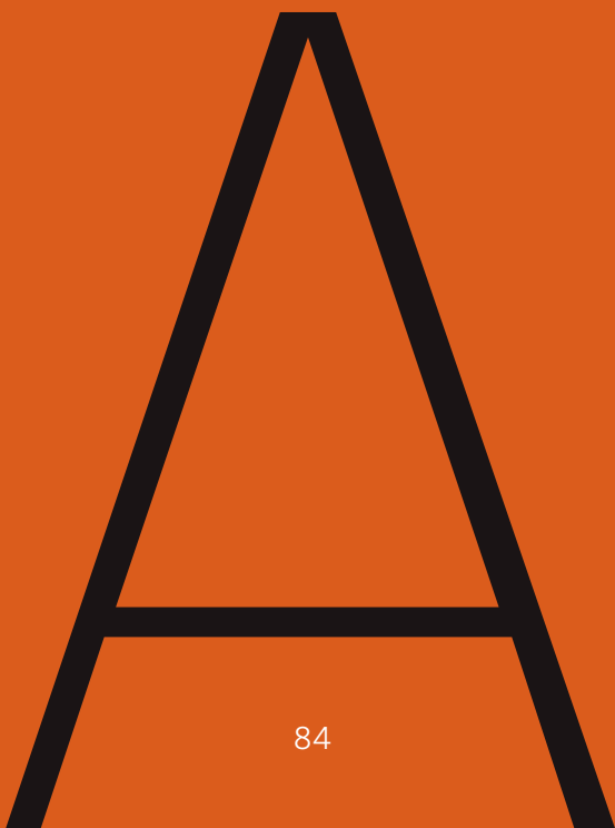
ILLUSTRATION BY SHOTOPOP